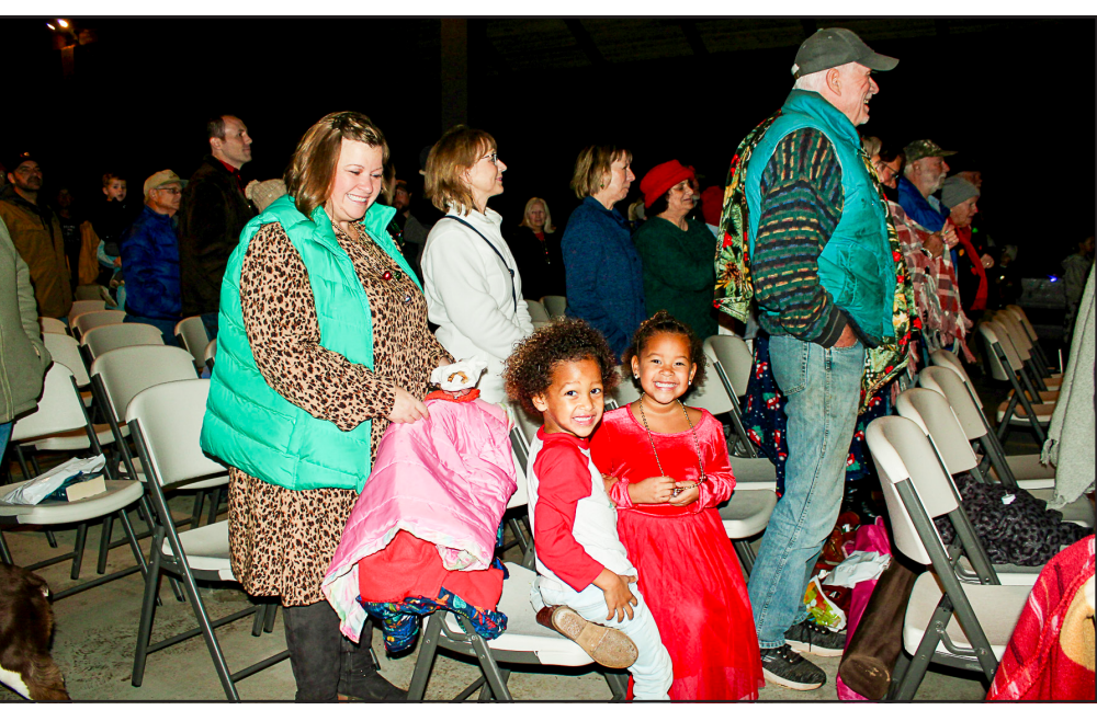
Icky weather did not deter families from celebrating the "reason for the season" during the 2023 Vogel Christmas Program, which once again had to move under the pavilion at Lake Trahlyta.

in a Manger" to establish this to the tree's lighting, but before fact, and shortly afterward, that, he explained how the tree Santa reappeared – this time to was a symbol of not only the address the crowd.