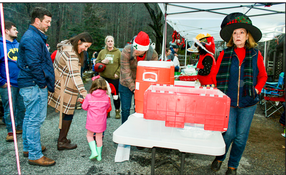
As always, local churches banded together to provide refreshments for guests of the Vogel Christmas Program.

Gradually, many in the audience joined her, and while several eyes were already misty